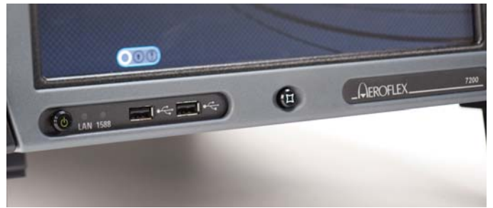
Figure 2 - LXI Class B compliant with IEEE 1588 synchronization of better than 50 ns over Ethernet

Unless they add significant value for our customers, we don't like proprietary components and interfaces any more than you do. That is why the 7200 and all of our CP based products were developed to leverage a tremendous number of open industry standards for both hardware and software components.