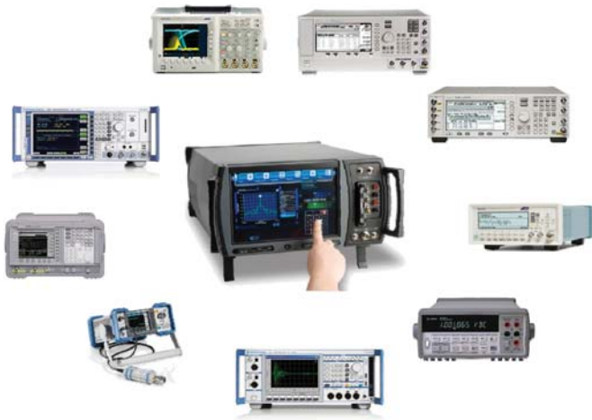
Figure 1: The 7200 takes the place of an entire suite of test equipment