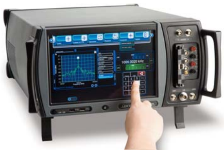
Figure 4 – State-of-the-Art Touch Screen User Interface

With a 12.1 inch high resolution touch screen based user interface, the 7200 provides the most advanced and user friendly operator interface in the industry. It's highly intuitive design is a result of 1000's of research and development hours focused on user experience, graphical design and content depiction, and modern user interface techniques applied to the unique needs of test instrumentation and its operating environments.